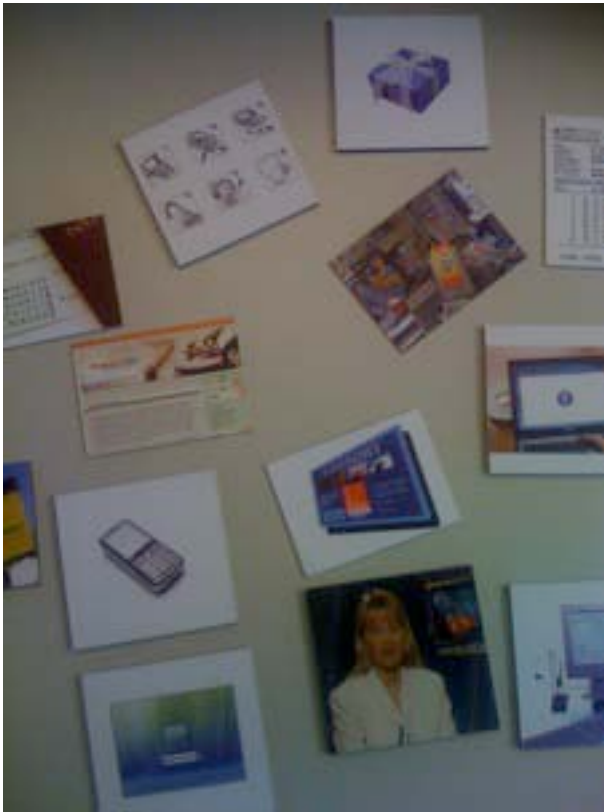
Figure 1: The first cards were images of individual touch-points and fairly large. Their tangibility was good, but they were too large when mapping complex service systems involving many touch-points.

The first cards were images denoting different touch-points. They were larger (ca. 15x15cm) and placed on foam-board. This made them tangible elements that were easy to handle and share and a strong improvement on post-it notes. However we found two problems with them. Firstly, they were too large and unwieldy when many touch-points were being grouped - they simply took up too much space on a table. Secondly, it was unclear from some of the images, which touch point they represented - the images were ambiguous.