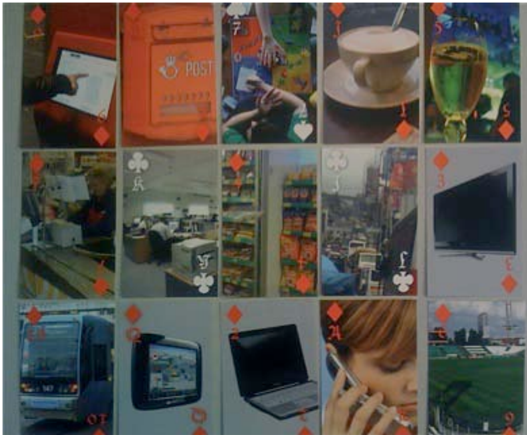
Figure 2: The second series of cards were playing card size and incorporated into a game. They incorporated more contextual information about the cards by often including contextual information in the images.

During development of the third, and present set of cards, the project leader and designers discussed the issue of confusion and multiple interpretations. This led to two decisions. Firstly, that we would put the name of the touch-point on the card. This enabled a quick recognition of the touch-point, and together with the image, presented an unambiguous representation. This led to a discussion regarding the choice of images for the cards, and the usage of the cards themselves. Were they to be abstracted and inspirational for idea generation in themselves, or should they be concrete representations of the touch-points? We chose to make them as clearly descriptive and concrete as possible based upon the confusions earlier reported. This eliminated the problems mentioned earlier, and smoothed out group processes, allowing the group to focus upon the innovation process rather than negotiation of meaning.