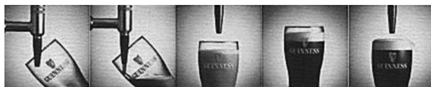
Figure 2 The 'Perfect Pint' of Guinness

But achieving the 'Perfect Pint' did not stop there. Research showed Guinness that consumer education was also critical if the consumption experience was going to be consistent—every time. Guinness needed to communicate to consumers their part in securing the 'Perfect Pint'. Point-of-sale laminated cards were used that explained, on one side, how to pour the Perfect Pint, and on the reverse side, the correct serving temperature and a ruler that allowed consumers to measure the correct thickness of the head on their pint. Consumers were also targeted with a highly successful advertising campaign that extolled the virtues of waiting for a perfect pint—as it takes between 90 and 120 seconds for a perfect pint of Guinness to settle. This activity needed to emotionally involve customers in playing their part in co-creating the perfect pint. Thirsty customers now wait patiently for their Guinness. They have become educated